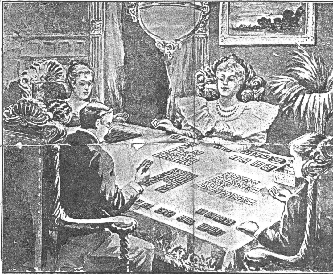
The Game NUMERICA as it is Played.

All other players arrange their counters in rotation and four of each denomination together, that they may be readily placed in the columns to be formed as they are called.