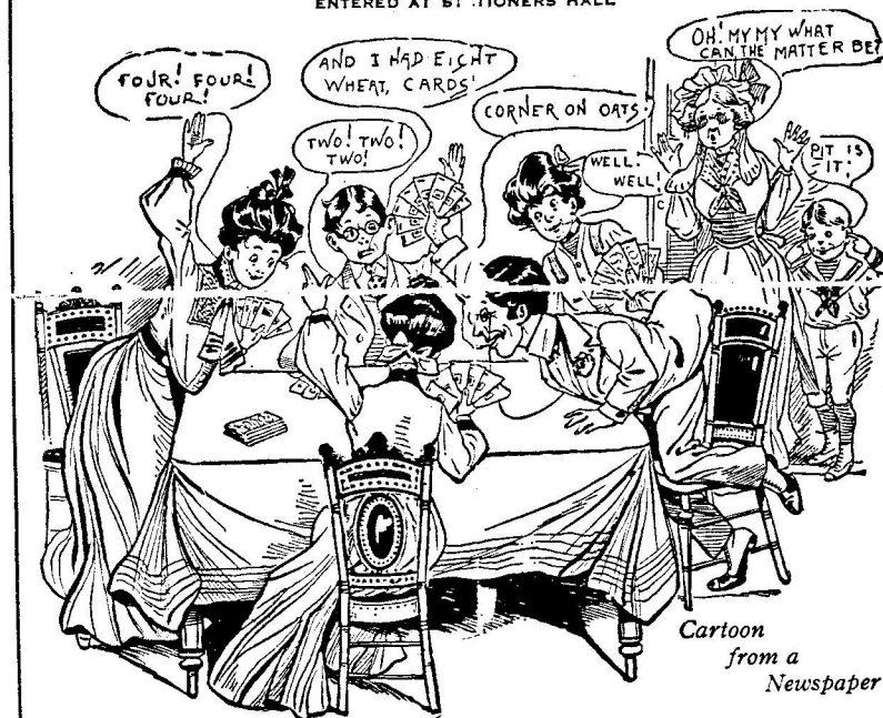
Cartoon from a Newspaper

REG. U. S. PATENT OFFICE ENTERED AT ST. JOHNS HALL