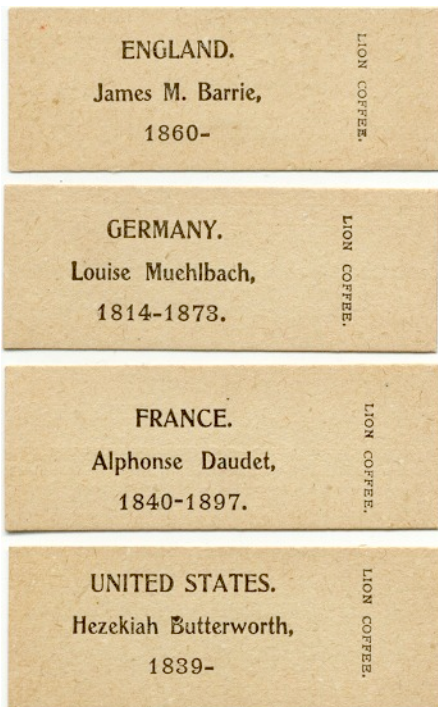
Card front (back is plain)

If played by two persons, only six cards should be dealt to each, the remainder of cards being placed face downward on the table. The game is then played just the same as described above.